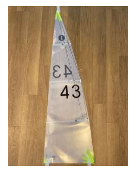
Inked on lines (for illustration purposes only) indicate a method of finding the measurement points. See also ERS G.5.4.

• Tape the sail down with masking tape with just sufficient tension to remove wrinkles that may exist across the lines of measurement ((ERS H5.1 (e)). This is particularly necessary if a jack stay is fitted to the mainsail luff and when measuring the headsail to remove any bunching. Sails that have been rolled for storage or delivery may also have wrinkles in leech and luff .