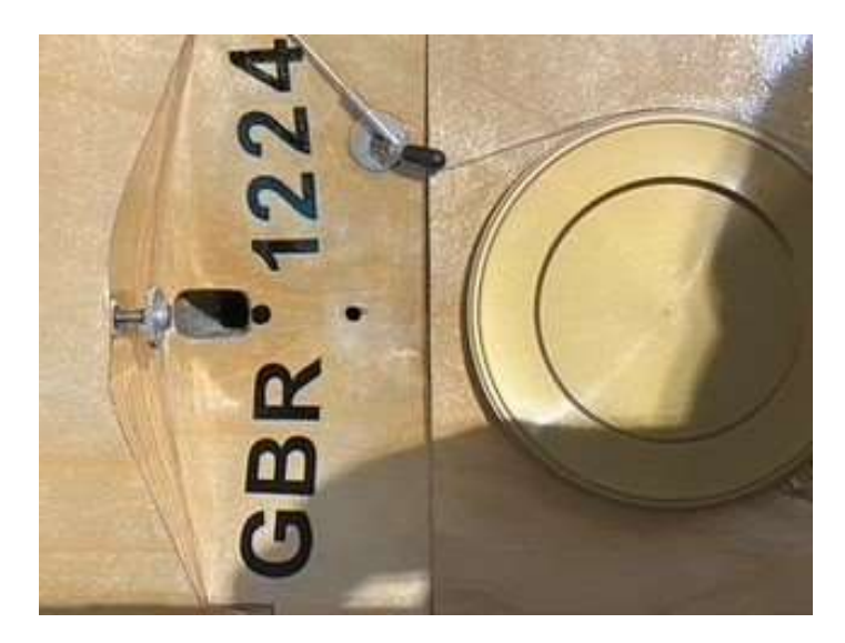
Hull registration number displayed on the external surface of the hull.